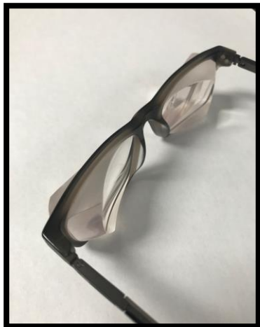
1.55 SV with 40 Diopters Out