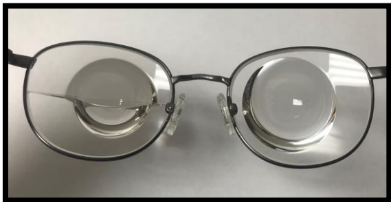
Lenticular Franklin: Top +27, Bottom +31