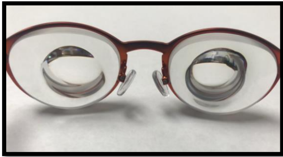
1.74 SV -60 Sph with Myodisc